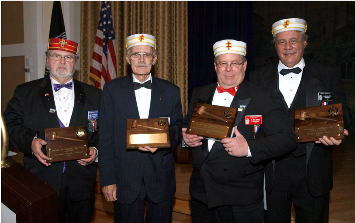
OUT WITH THE OLD – 2008 PRESIDING OFFICERS