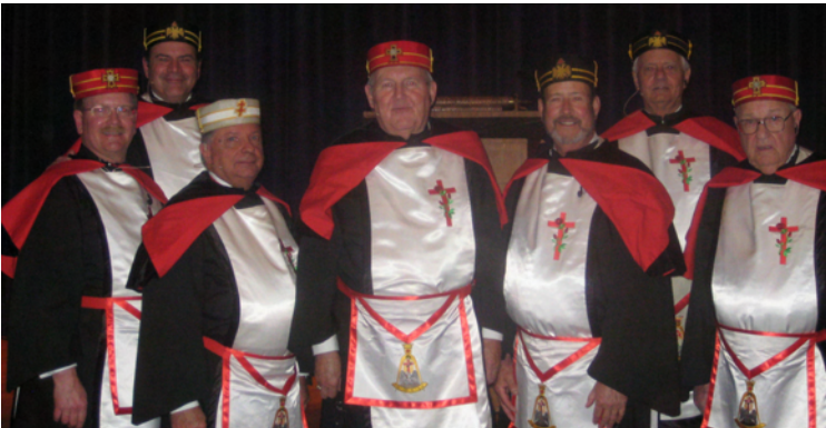
Rocky Mountain Chapter of Rose Croix

During the past month, Easter services for Christians, Passover for Jews and Renewal and Remembrance for Scottish Rite Masons all served as a focus time to contemplate our mortality and renew our faith. We've now entered the springtime season where plants emerge from dormancy, seeds sprout and grow and each of us embraces a new enthusiasm for the future. Baseball is full of hope, the mountains offer beautiful solitude and gardens bring us closer to our roots (no pun intended). What a great time to get outside and share these special days with friends and family.