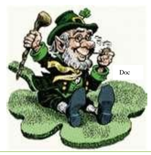
Happy St. Patrick's Day