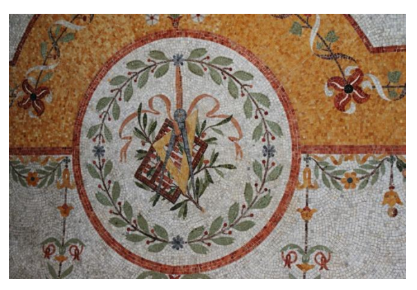
A mosaic found in the Library of Congress.

Poster used during Abe Lincoln's time displaying the "All Seeing Eye".