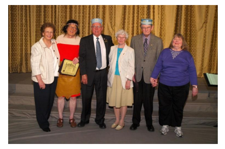
auditorium. Entertainment was a public presentation of

Reunion Dinner/Entertainment of the traditional banquet on Saturday night, the recently concluded Spring Reunion featured a Friday night roast beef dinner, followed by a presentation of 25 year pins/50 year hats and class recognition awards in the