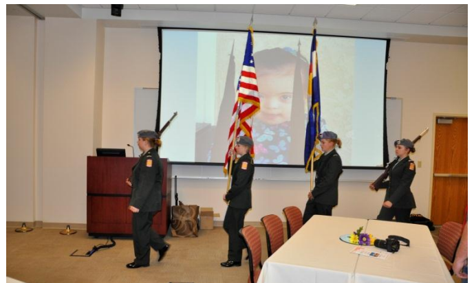
Central High School JROTC Color Guard Posting the Colors