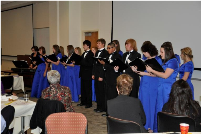
Fruita-Monument High School Choral Singers

The Grand Junction Central High School Junior ROTC Color Guard performed the posting and retreat of the Colors. In addition, 23 choral singers from the Fruita-Monument High School gave an inspiring 20-minute program of love and caring with almost every selection giving recognition to the Grand Architect of the Universe. It was an inspiring and meaningful performance in song.