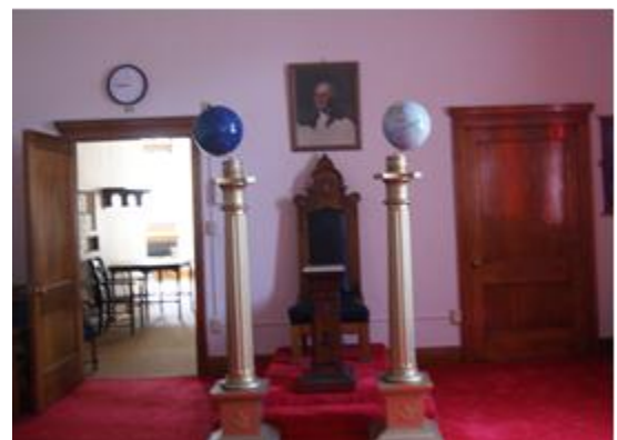
Fort Collins' small lodge room B & J