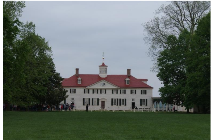
Washington’s Mount Vernon

Do we know if they put the lessons taught in that degree into action or use? We may never know for sure if it had a small part or a larger one in all this, but the coincidence of the two may be related.