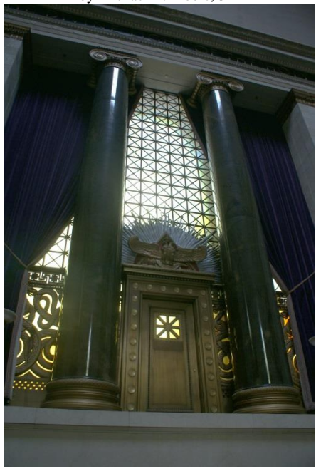
Columns in the H.O.T.