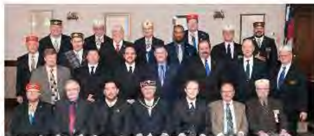
SPRING CLASS OF 2015