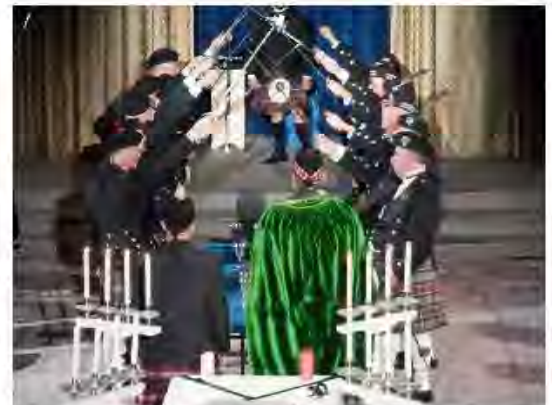
The Venerable Master is received.

SET ASIDE TIME TO REVISIT THE TEACHINGS.