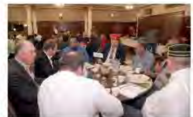
Fellowship and Fun.

First line signer incentive program. Four petitions in a calendar year will pay your membership for a year. If you are a life member then it entitles you to receive stated meeting dinners for a year.