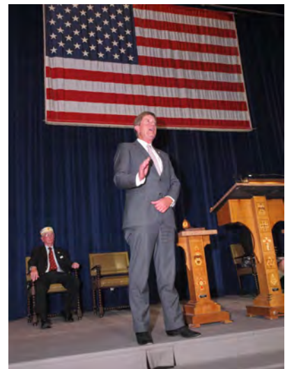
Congressman Scott Tipton

Veterans and First Responders Program. Our Friday night event had many highlights. First, we were honored by three fifty-year recipients receiving their Blue Hats. We are lucky to have so many dedicated members which include men who have been in the Scottish Rite for 50 years. Next, we were honored to have U.S. Congressman and Brother Scott Tipton, who delivered an inspired talk about our veterans and the Masonic fraternity.