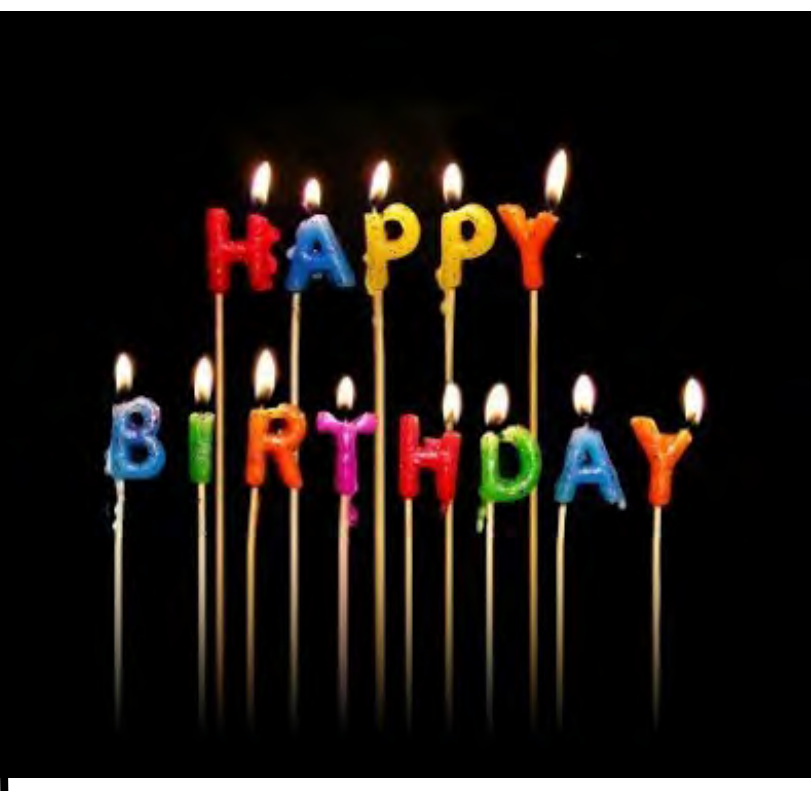
To ALL our Brothers