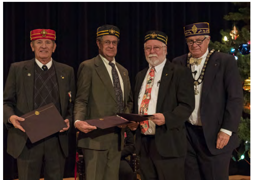
From the Secretary's Desk - Continued from previous page

Twenty-Five Year membership Certificates and pins were presented to: