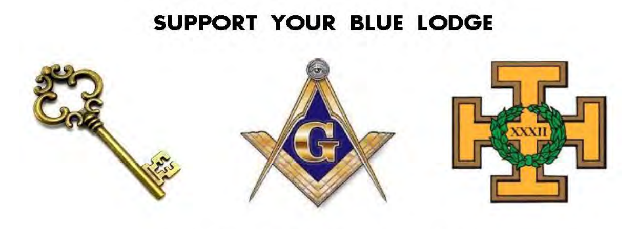
OUR KEY TO NEW MEMBERS

DID YOU KNOW ... Transportation can be arranged for those who need a ride to our stated meetings, the Reunions, and Denver Consistory special events. All you need to do is CALL THE OFFICE at 303-861-4261 and let us know you need a ride. You do not need to stay home because you do not have transportation to the Consistory.