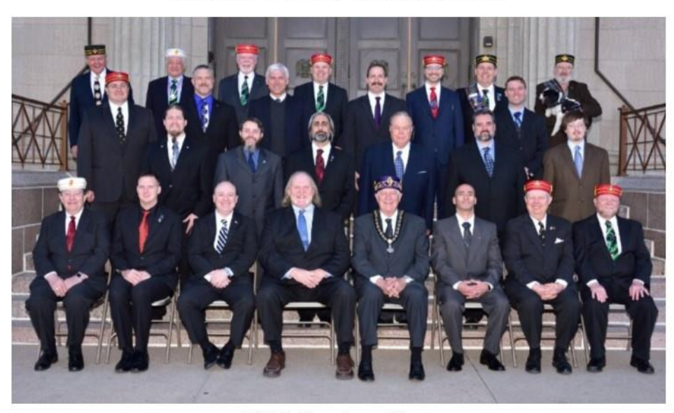
2019 Spring Class

AN OPPORTUNITY TO REUNITE WITH YOUR BROTHERS REVISIT THE TEACHINGS