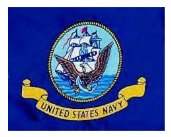
October 13, 1775 244 years old