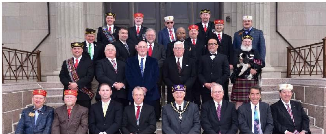
Fall Class 2019

AN OPPORTUNITY TO REUNITE WITH YOUR BROTHERS REVISIT THE TEACHINGS