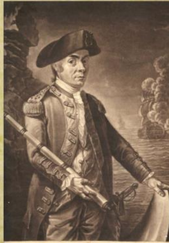
JOHN PAUL JONES, Commander of a Squadron in the Service of THIRTEEN UNITED STATES OF NORTH AMERICA.