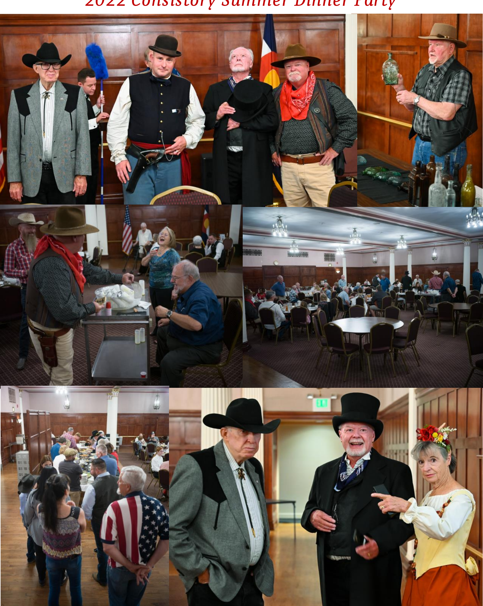
2022 Consistory Summer Dinner Party