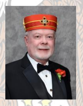
Commander Colorado Council of Kadosh