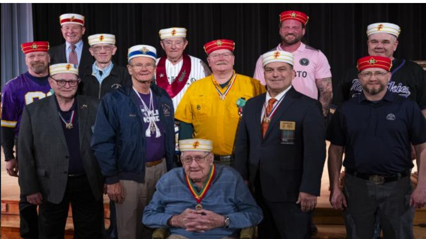
Rocky Mountain Rose Croix