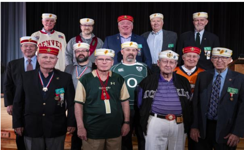
Centennial Lodge of Perfection

Scottish Rite Golf Classic - Monday, August 12 th - The Scottish Rite Masonic Center golf tournament to benefit the Scottish Rite Masonic Center and the Scottish Rite Foundation will be held at Hiwan Golf Club. Go to www.scottishritegolf.org (the tournament website) to sign up.