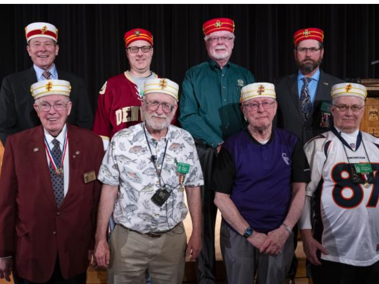
Colorado Council of Kadosh