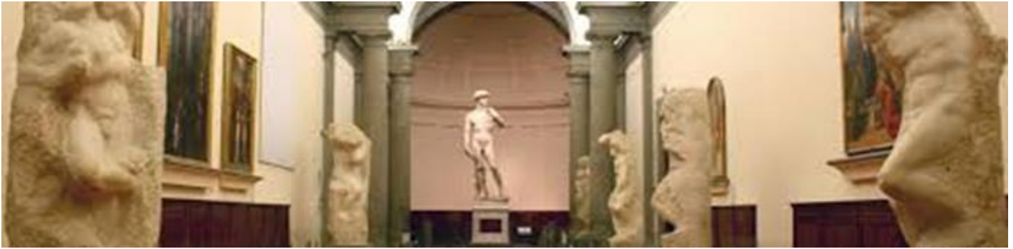
exhibit at the Accademia. Although unfinished, they are among Michaelangelo's best known works.

The figures have been described for centuries as “seeming to emerge” or “struggling to emerge” from their blocks of marble, and Michaelangelo said of his work that his task was to help the form that was always within the marble escape. The symbolism of that, as a metaphor for our journey from rough to perfect ashlar, is worthy of note...especially considering our reliance on The Artist's Plan to guide us on the way. But as I reflected on the unfinished works—and especially as I considered them in contrast to the stunning masterpiece standing just steps away—there was something significant underlying it all that I couldn't quite understand...until later. It was the stone itself!