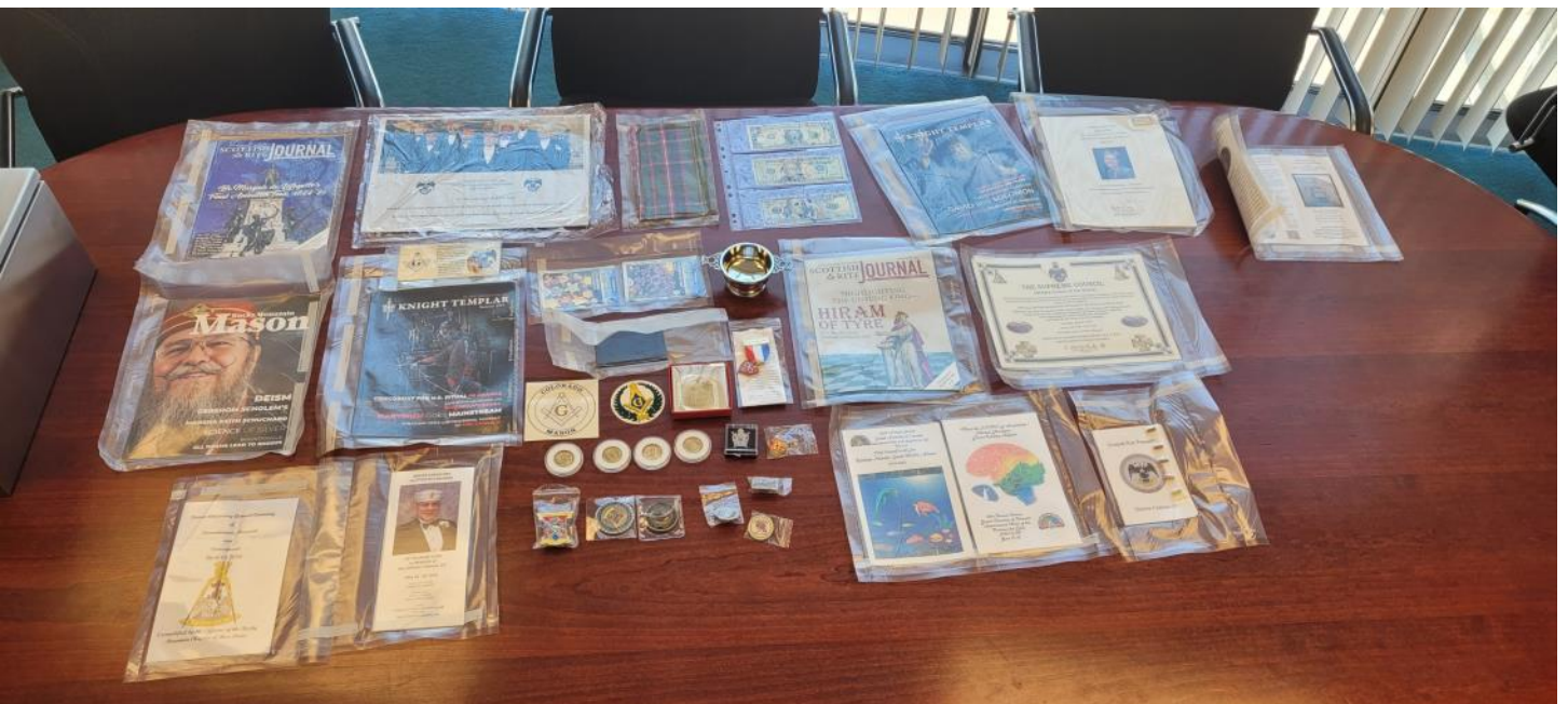
Fig 5: Contents of New Time Capsule