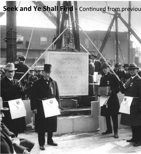
Fig. 1: 1924 Time Capsule