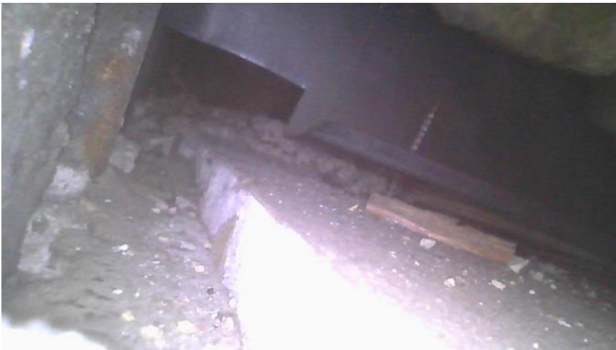
Fig 3: Time Capsule Shelf