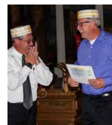
Having Fun !