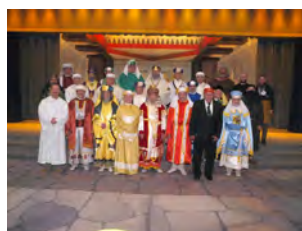
Degree Team in Costume