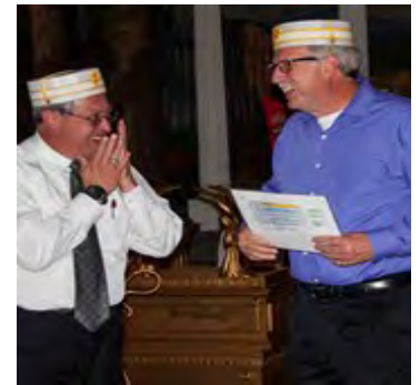
Having Fun !

First line signer incentive program. Three petitions in a calendar year will pay your membership for a