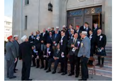
2016 Fall Class

ARIZONA, CALIFORNIA, KANSAS, NEBRASKA, NEVADA,